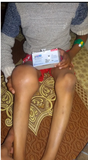
A boy in Yemen receiving a shipment from Project SHARE