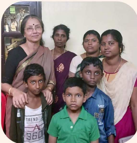
Usha with three sponsorship beneficiaries and their moms.