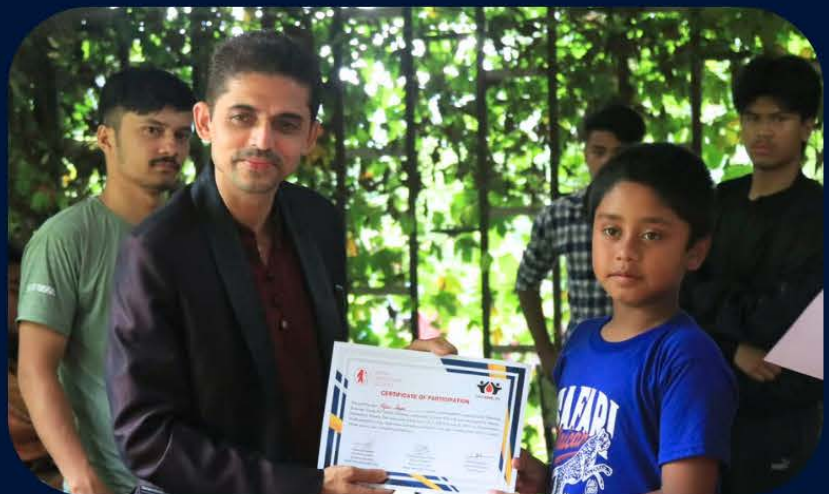
A child from Nepal receiving a Certificate of Participation