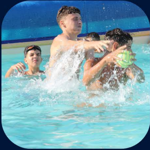
Fun in the pool in Romania

This year we were able to support camps in the Dominican Republic, Romania, Nepal, India and Cambodia! These camps are a great time for our beneficiaries to connect with their community and create lasting memories.